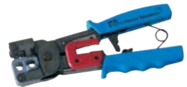
Ratchet Telemaster™ Modular Plug Crimper Telemaster™ Modular Plug Crimper