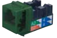
Green - GN