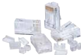
CAT6 RJ-45 8P8C Modular Plugs, 25/Card