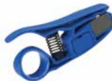
PrepPRO® UTP/Coax Cable Stripper