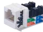
White - WH