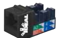
Black - BK