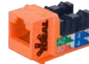
Orange - OR