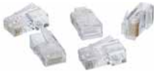
CAT5e RJ-45 8P8C Modular Plugs, 50/Card CAT5e RJ-45 8P8C Modular Plugs, 100/Bag