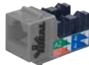
Grey - GY