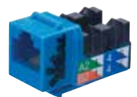
Blue - BU