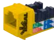
Yellow - YL