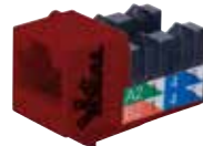
Red - RD