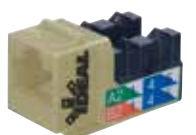
Ivory - IV