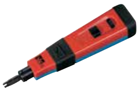
Puchmaster™ II 110/66 Punchdown Tool