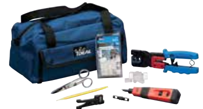
PRO Network/Telco Installer Kit