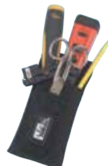
Technician's Service Kit