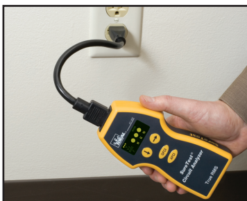
Troubleshoots branch circuit problems with a variety of tests at the receptacle.