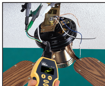
AFCI testing with alligator clips on an installed device.