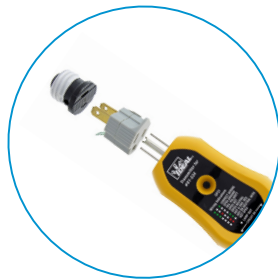
Lead Adapter Kit Provides adapters for use in lighting fixtures.