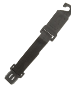
UMHS-757 Universal Magnetic Hanging Strap