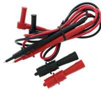
TL-757 Test Leads