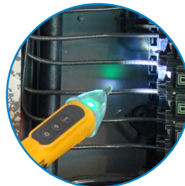
Detects AC voltage at panels