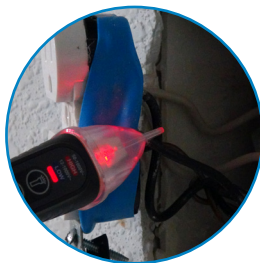
Detects AC voltage on conductors