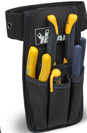
(Products not included)