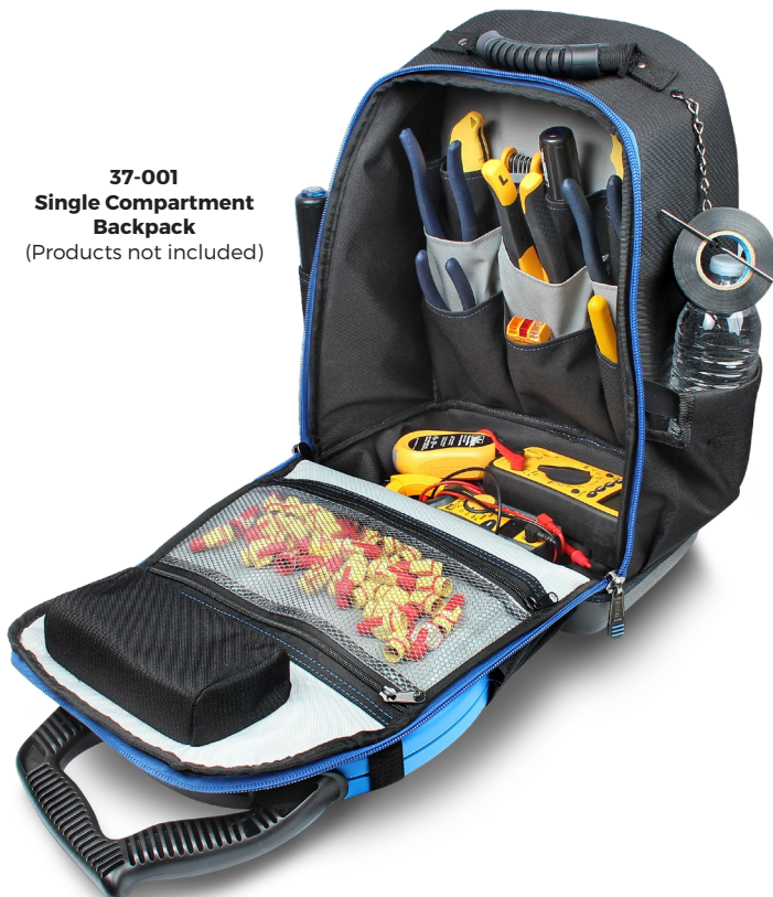
37-001 Single Compartment Backpack (Products not included)

The IDEAL® Pro Series Single Compartment Tool Backpack has a compact, lightweight design providing a solution for any tradesperson. It contains multiple tiered pockets designed to easily access and organize the tools and equipment you need most. Equipped with a protective phone/sunglasses case, durable molded bottom, a fish tape pocket, tape chain and tape measure clip, this pack has everything needed to easily manage and carry your tools between jobsites comfortably.