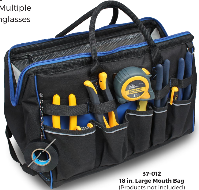
37-012 18 in. Large Mouth Bag (Products not included)