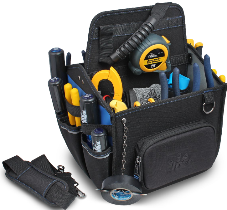
37-030 Molded Bottom Premium Tool Carrier (Products not included)