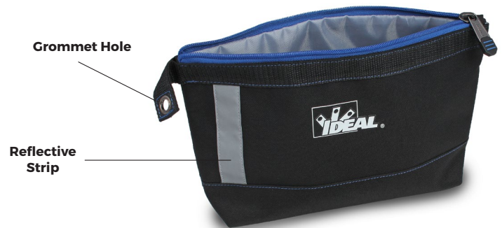
Stand Up Configuration