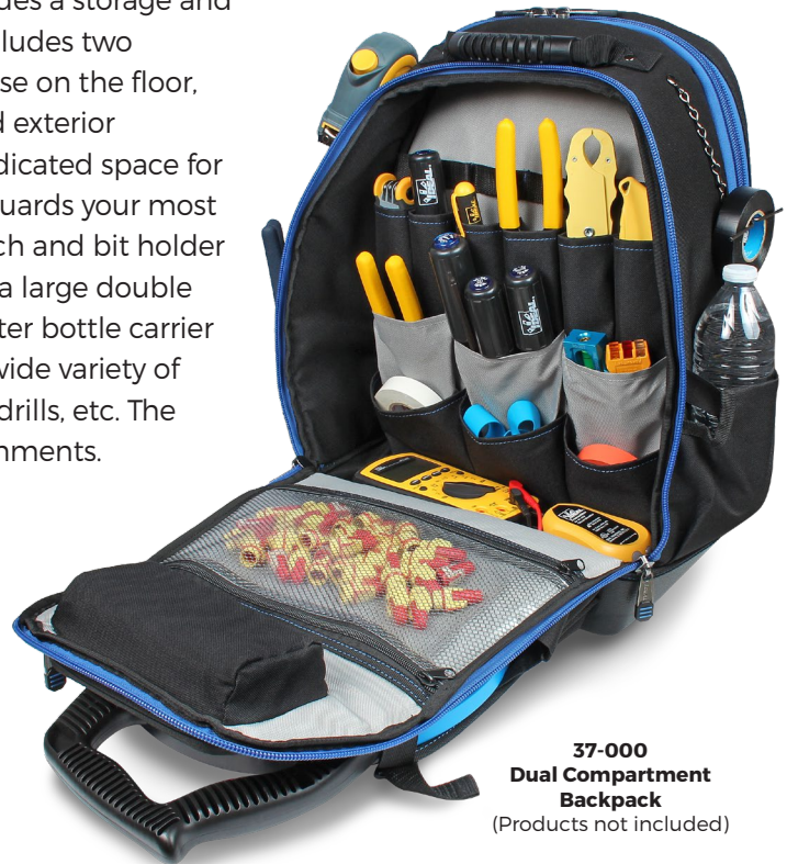
37-000 Dual Compartment Backpack (Products not included)

The IDEAL® Pro Series Single Compartment Tool Backpack has a compact, lightweight design providing a solution for any tradesperson. It contains multiple tiered pockets designed to easily access and organize the tools and equipment you need most. Equipped with a protective phone/sunglasses case, durable molded bottom, a fish tape pocket, tape chain and tape measure clip, this pack has everything needed to easily manage and carry your tools between jobsites comfortably.