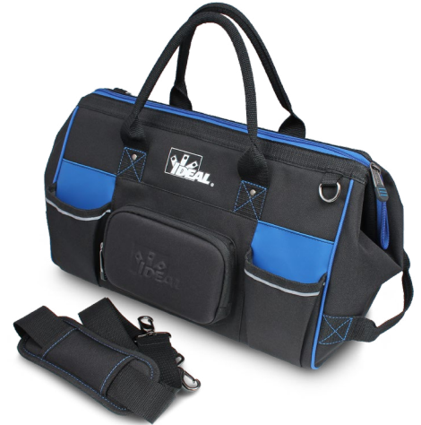
Reinforced Side Walls