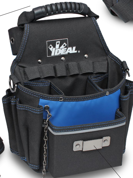
Tape Measure Clip