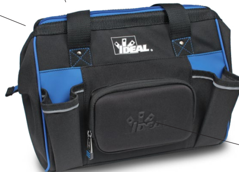
Phone / Sunglasses Case