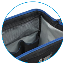
Reinforced Side Walls