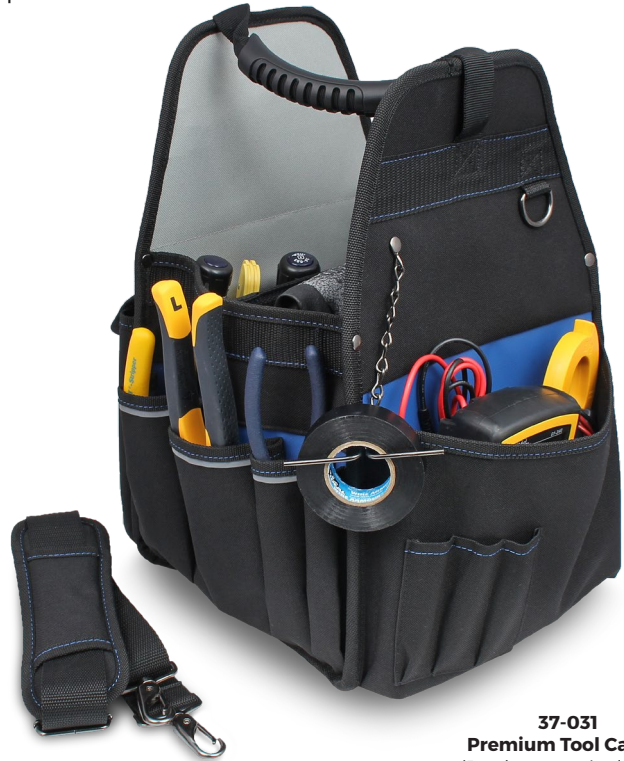
37-031 Premium Tool Carrier (Products not included)