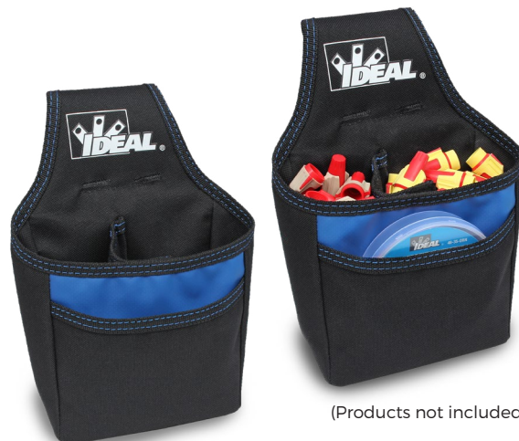
(Products not included)