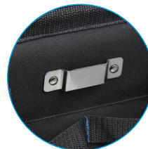
Tape Measure Clip