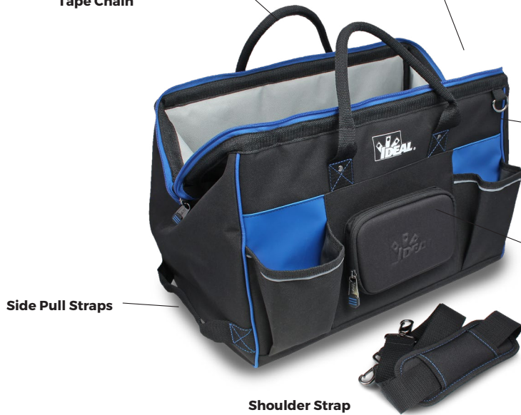
Side Pull Straps