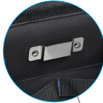
Tape Measure Clip