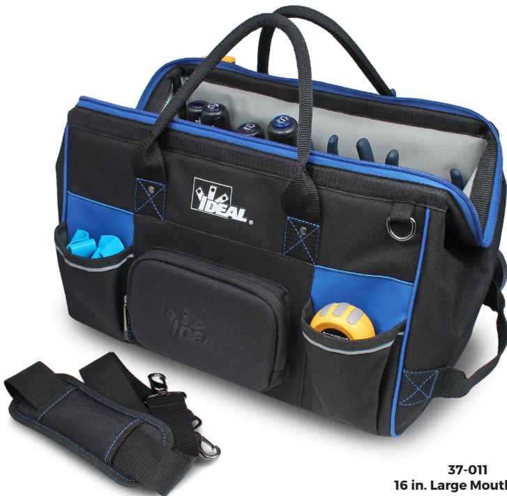
37-011 16 in. Large Mouth Bag (Products not included)