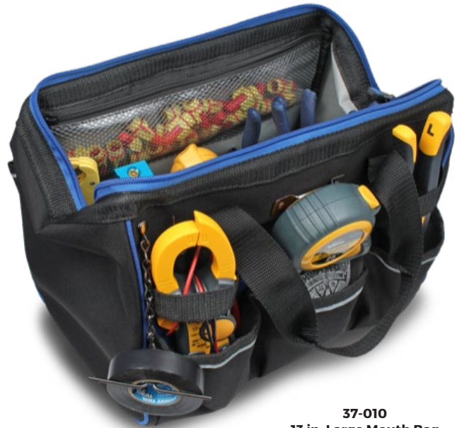
37-010 13 in. Large Mouth Bag (Products not included)