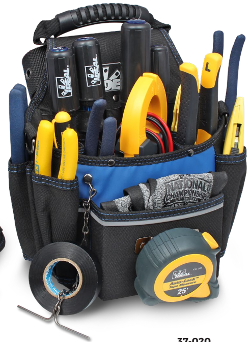
37-020 Premium Tool Pouch (Products not included)