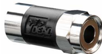
89-041 RG-6 Quad NJX™