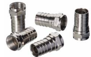
85-036 59F Crimp