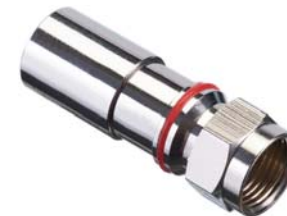
92-610 59F Compression