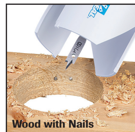
Wood with Nails