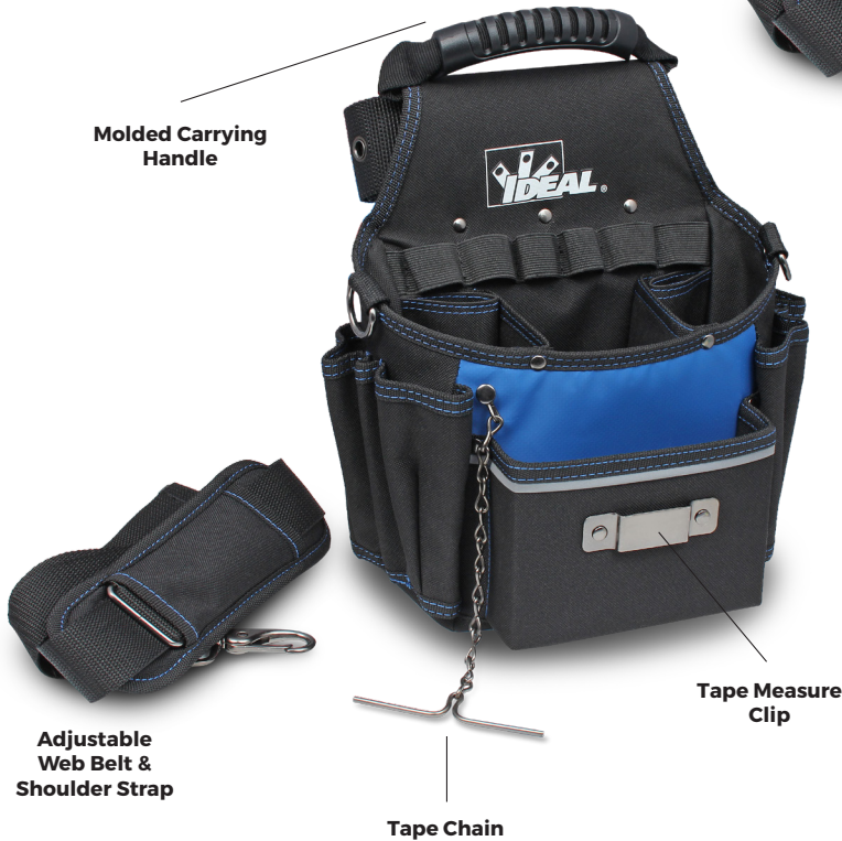
Molded Carrying Handle