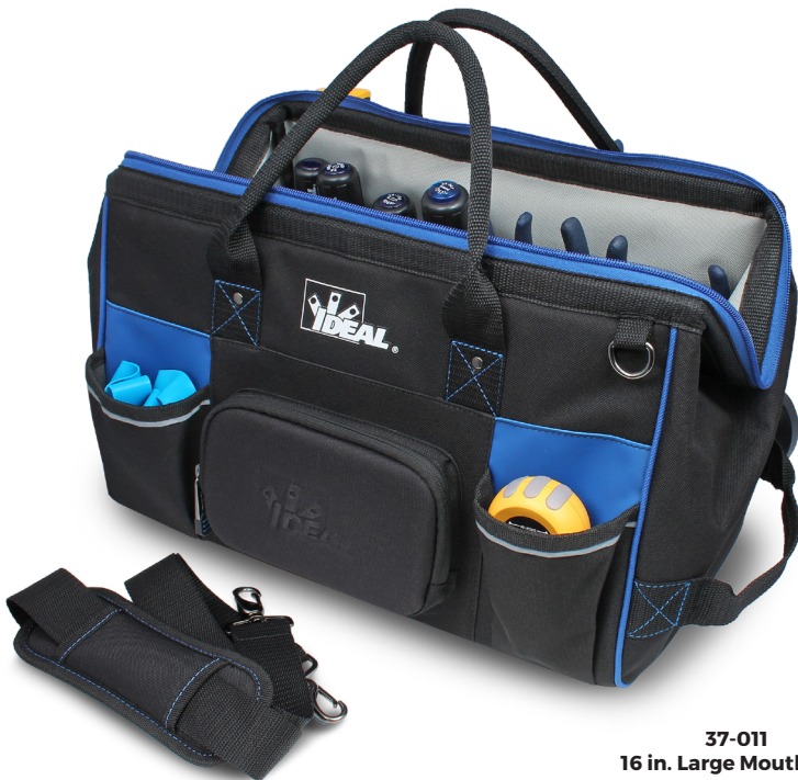
37-011 16 in. Large Mouth Bag (Products not included)