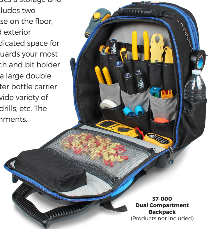
37-000 Dual Compartment Backpack (Products not included)

The IDEAL® Pro Series Single Compartment Tool Backpack has a compact, lightweight design providing a solution for any tradesperson. It contains multiple tiered pockets designed to easily access and organize the tools and equipment you need most. Equipped with a protective phone/sunglasses case, durable molded bottom, a fish tape pocket, tape chain and tape measure clip, this pack has everything needed to easily manage and carry your tools between jobsites comfortably.