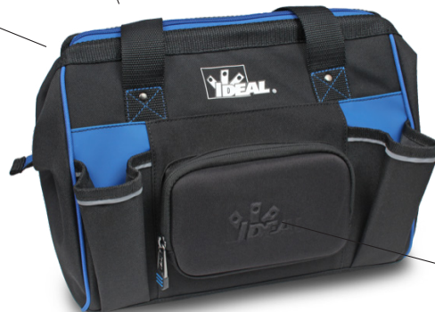
Phone / Sunglasses Case