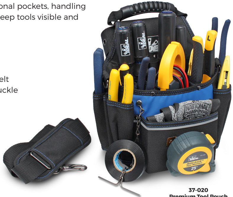
37-020 Premium Tool Pouch (Products not included)