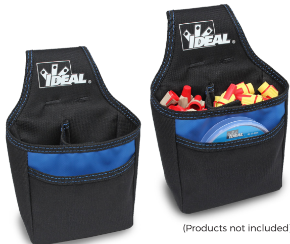
(Products not included)