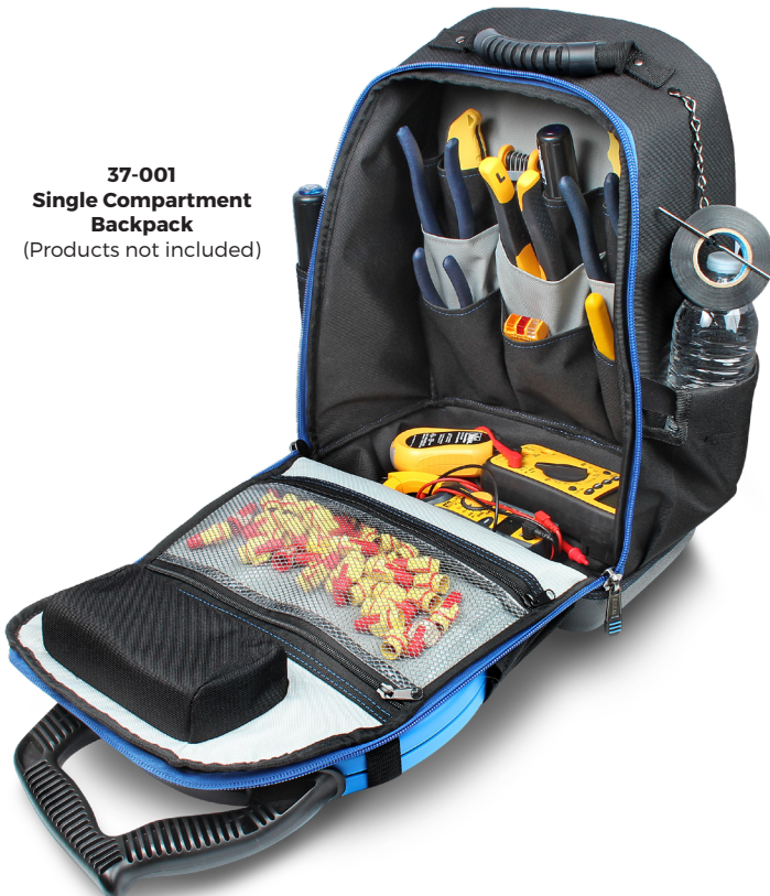
37-001 Single Compartment Backpack (Products not included)

The IDEAL® Pro Series Single Compartment Tool Backpack has a compact, lightweight design providing a solution for any tradesperson. It contains multiple tiered pockets designed to easily access and organize the tools and equipment you need most. Equipped with a protective phone/sunglasses case, durable molded bottom, a fish tape pocket, tape chain and tape measure clip, this pack has everything needed to easily manage and carry your tools between jobsites comfortably.