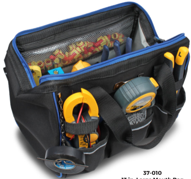
37-010 13 in. Large Mouth Bag (Products not included)