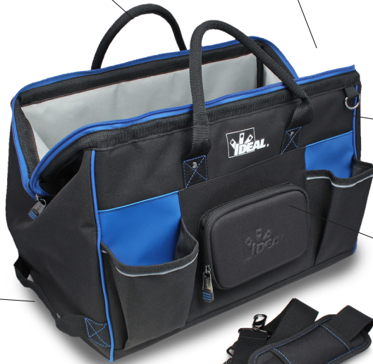
Side Pull Straps