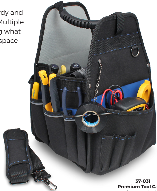
37-031 Premium Tool Carrier (Products not included)