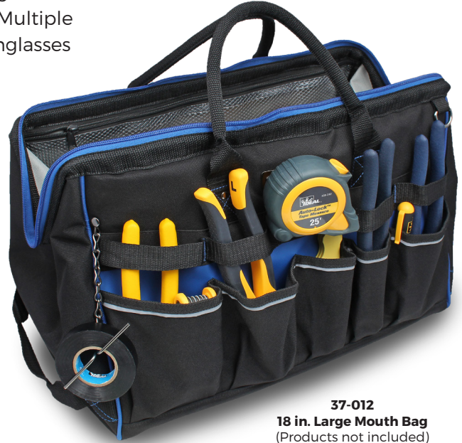
37-012 18 in. Large Mouth Bag (Products not included)