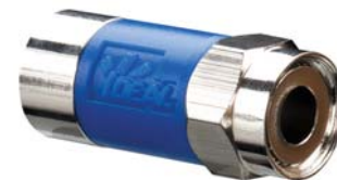
89-040 RG-6 NJX™